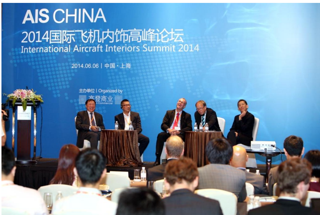
IMAGE 9:The seminar of how to meet the needs of market segment according to the design and manufacture of aircraft interior innovation.