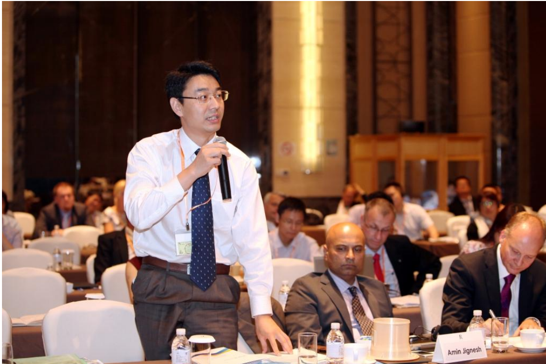
IMAGE 7: The audiences actively asked questions to the speakers after their speech.